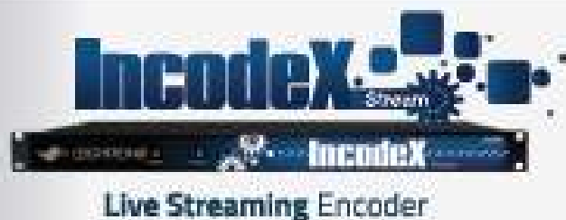
Live Streaming Encoder