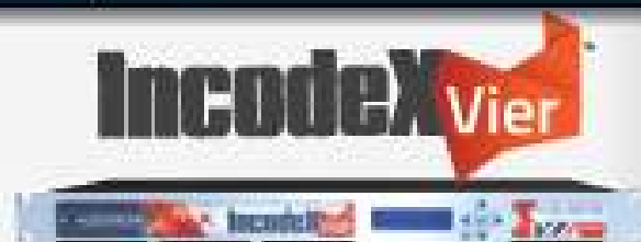
Live & Video-on-Demand Streaming Encoder