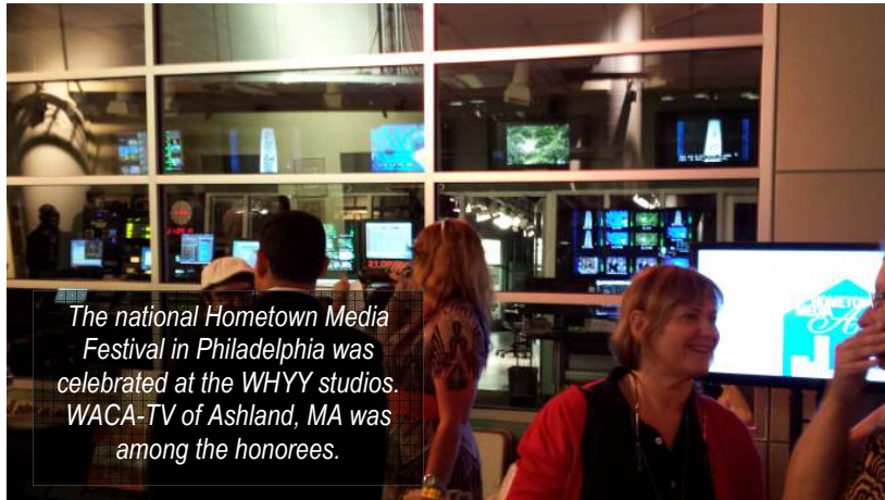
The national Hometown Media Festival in Philadelphia was celebrated at the WHY studios. WACA-TV of Ashland, MA was among the honorees.